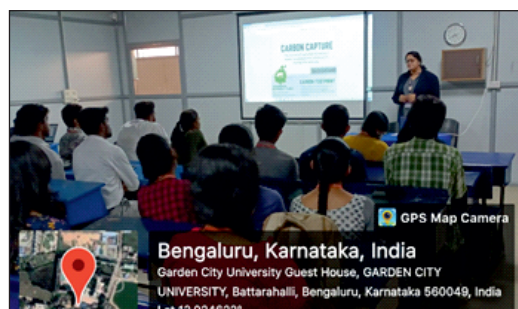
Department of Computer Science, School of Computational Sciences and IT

15 October 2022, Bengaluru: Commemorating the birth anniversary of former President of India, Bharat Ratna Dr. A.P.J. Abdul Kalam, Garden City University celebrated National Innovation Day throughout the campus at a departmental level as students and faculty members presented a variety of ideas for innovation and research as part of the day's program.