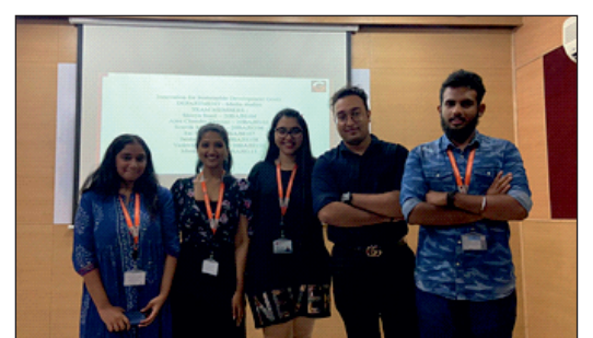
School of Media Studies